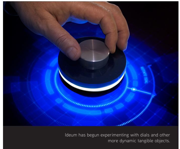
Ideum has begun experimenting with dials and other more dynamic tangible objects.

support and absolute orientation. (See our Tangible Engine wiki for more information.) In addition, we’ve introduced the Tangible Engine Media Creator . It has a GUI and a drag-and-drop interface that allows for rapid prototyping. At present, it can only be used to create object-follow applications. However, having a tool that allows for rapid prototyping and quick evaluation is important for developing these types of experiences. The easier an application is to develop and deploy, the more examples are built, leading to additional feedback and the further development of interface and design standards.