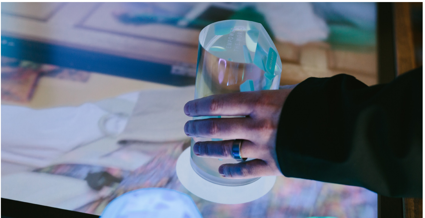
A prototype with a large acrylic totem.

These kinds of experiences have been quite popular among our Fortune 500 clients to demonstrate corporate initiatives, show solutions for complicated industrial processes, teach doctors about new pharmaceuticals, share information about innovations in medical devices, and promote new and emerging products. Ideum has not yet deployed an experience using this design approach in the museum world, but with the release of our Tangible Engine SDK , we know that other design firms (such as Stimulant in San Francisco ) and museums are beginning to experiment with new applications as well. We will provide more examples as they become available.