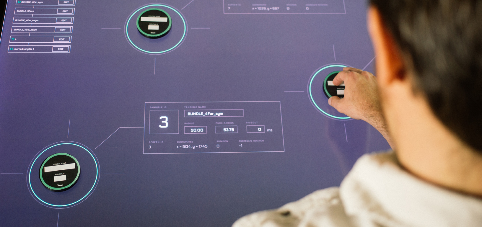
The Tangible Engine Visualizer, which comes with the Tangible Engine SDK.

Multitouch tables and displays provide important benefits for users in museums and other public spaces, including using flexible, reconfigurable platforms to present information and experiences and allowing multiple users to explore content simultaneously (Creed, Sivell, and Sear, 2013; East, 2015). Using physical objects in conjunction with multitouch tables has been possible since the first such tables were developed a decade ago. In fact, the value of receiving tactile feedback and being able to enter or manipulate information while looking at a screen have been recognized since computer interfaces were in their infancy (Weiss, Wagner, Jansen, Jennings, Khoshabeh, Hollan, & Borchers, 2009). However, the development of tangible-object interfaces picked up speed with technological advances leading to a broader range of touch-sensitive input devices.